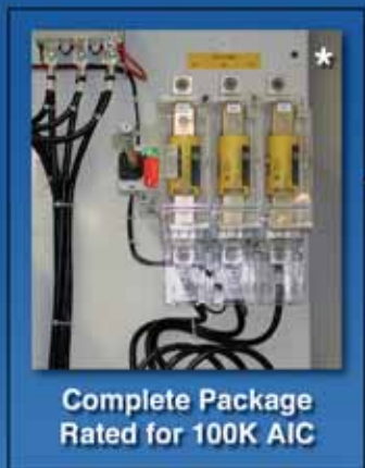
Complete Package Rated for 100K AIC