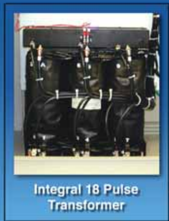
Integral 18 Pulse Transformer