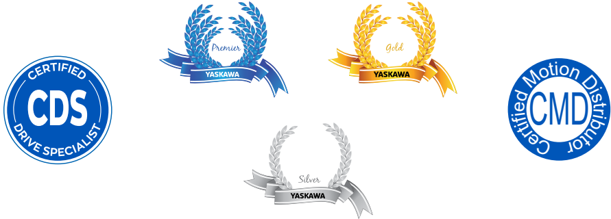
Yaskawa maintains certification levels for its distribution channels

They are certified and re-certified every 2 years to assure they can provide the best customer solutions.