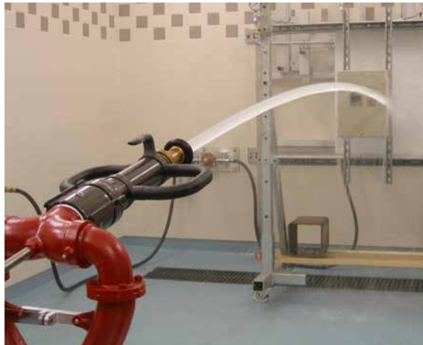
Washdown testing performed in our ISO certified test lab

Yaskawa products are tested not only under normal spec conditions but also for extreme environmental conditions.