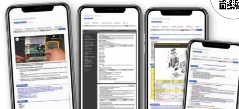
The Yaskawa Solution Center provides instant access to how-to videos, user manuals, technical documentation, and more