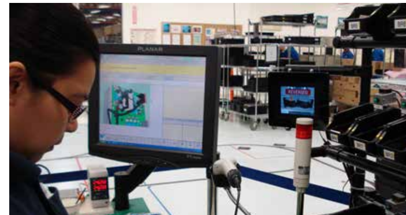
Paperless online resources for production associates