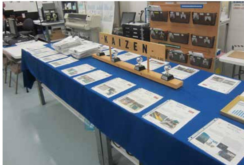
The Kaizen philosophy allows for improved quality and reduced costs

Yaskawa has incorporated the Kaizen philosophy of continuous improvement into every facet of its operations. Kaizen literally means “change for the better”. Key elements of the process are teamwork, personal discipline, improved morale, quality circles, and suggestions for improvement from all levels of employees. The ultimate effects of the Kaizen process, elimination of waste and inefficiency, achieving discipline and standardization, mean that every day Yaskawa is improving the quality of its products while lowering costs.