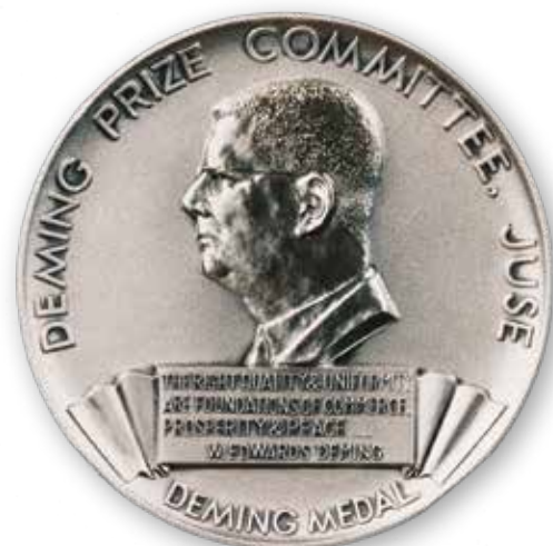
Edwards R. Deming Medal for Quality

We're the only industrial drives and motion control manufacturer to win the Deming Medal, the most prestigious quality award in manufacturing. Yaskawa constantly tracks and measures product failures in time (FIT). The actual FIT data demonstrates a high quality and reliability rate that is the envy of our Industry. This field data confirms that we do, in fact, exceed our design targets for reliability.