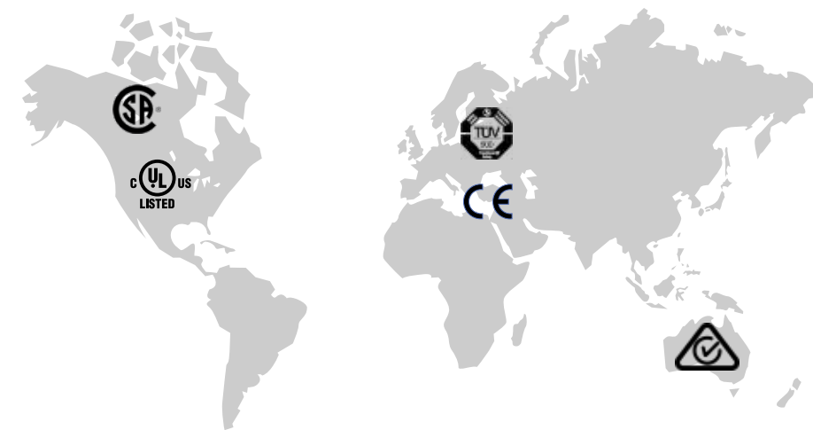
Yaskawa global certifications

Listening to the customer is the first, and most important step in our design process.