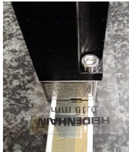
Figure 3: Shim placement between readhead and scale