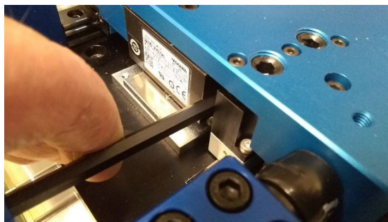
Figure 4: Placement of the T-handle hex key or equivalent