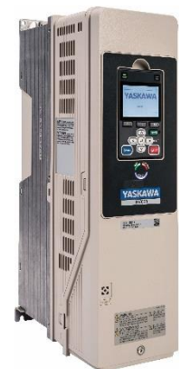
Yaskawa HV600 HVAC Drives for Fan and Pump Applications