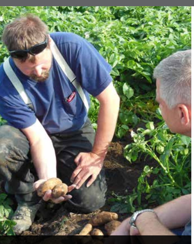
YASKAWA ASSOCIATES WORK CLOSELY WITH END-USERS TO UNDERSTAND THEIR BUSINESS BETTER. THIS ENABLES US TO PROVIDE THE MOST INTELLIGENT SOLUTION TO THEIR CHALLENGE.