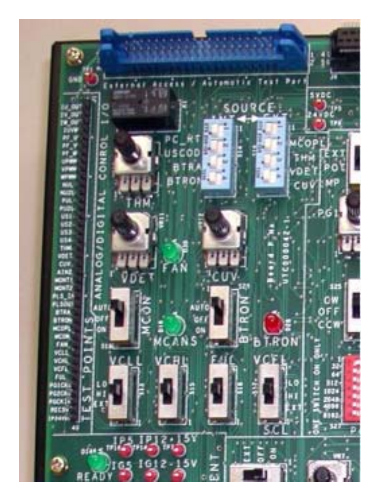
Figure 5: The test points and external access port (EAP) on the simulator