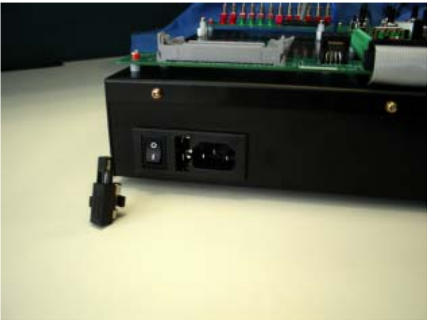
Figure 6: Power entry module with on/off switch and spare fuse inserts