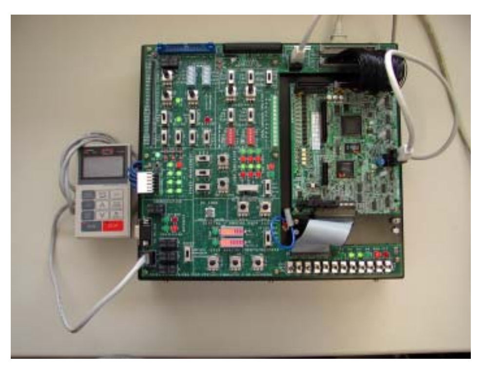
Figure 2: Simulator with G7 control card installed and running under simulated load