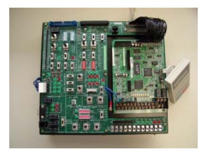
Figure 4: Simulator with G5/P5/PS5 control card installed

* Please note that when mounting a control card to the unit, in order to keep all the settings inside control card unchanged, you might need to try every single setting of S36 and recycle the power each time by S37 push button, to check which code matches with the control card's. This will take about 1 minute at the worst case. ** VR11 will cause OV or UV faults, when rotated toward left or right ends. Please adjust it around the middle until the faults go away automatically.