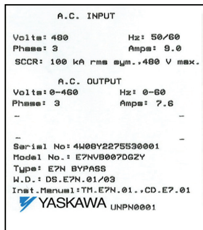
Figure 2 - (The new markings must be visible, displaying information such as manufacturer's name; supply voltage, phase, frequency and full-load current; short circuit rating; and electrical wiring diagram.)