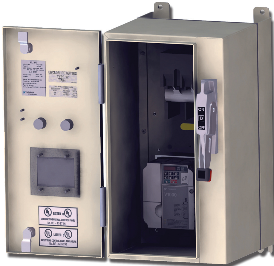
Figure 1 - Typical Industrial Control Panel

SCCR is defined as the maximum short circuit current that a component, assembly or piece of equipment (drive or panel) can safely withstand when protected by a specific over-current protective device including fuses, circuit breakers or a combination motor controller. One important aspect about the new short circuit current ratings is that it represents the maximum amount of fault current that the assembly can withstand under fault conditions. A benefit of assembly ratings is that they take into account all components within the equipment, rather than just the main over-current protective device.